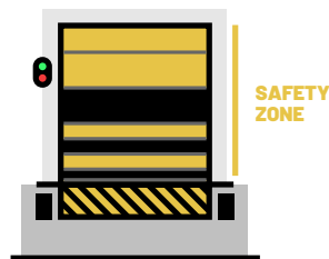
Fall Guard Safety System

While the other guys aim to check the OSHA box, they create additional risk by allowing falls over or through their "barrier." Fall Guard creates a complete safety zone covering the entire opening of your loading dock, ensuring maximum safety while minimizing risk at your facility.