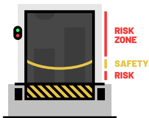
Dock Chain System